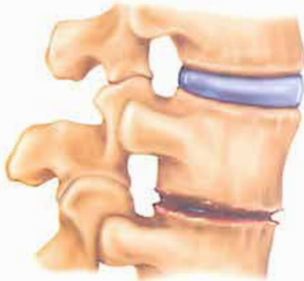
STAGE 3: Advanced Degeneration