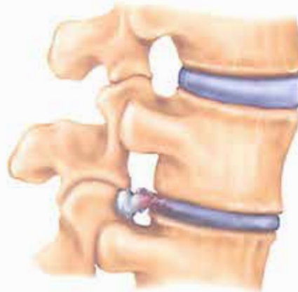
STAGE 2: Herniated Disc

Pump Mechanism of Disc Nutrition Circulation of water, oxygen, and nutrients in and out of the disc