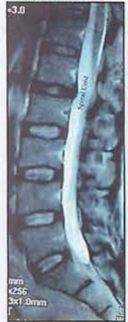
MRI of Herniated Spinal Disc